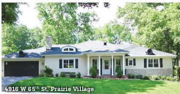
4916 W 65th St, Prairie Village