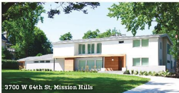
3700 W 64th St, Mission Hills