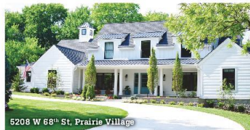
5208 W 68th St, Prairie Village