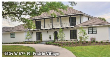
4604 W 87th Pl, Prairie Village