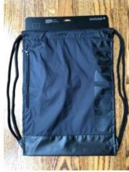
Back with extra zipper pocket