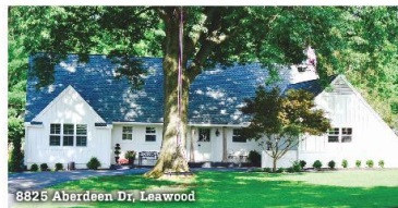
8825 Aberdeen Dr, Leawood

Please join us and be a part of this wonderful fundraiser for the Shawnee Mission East SHARE Program!